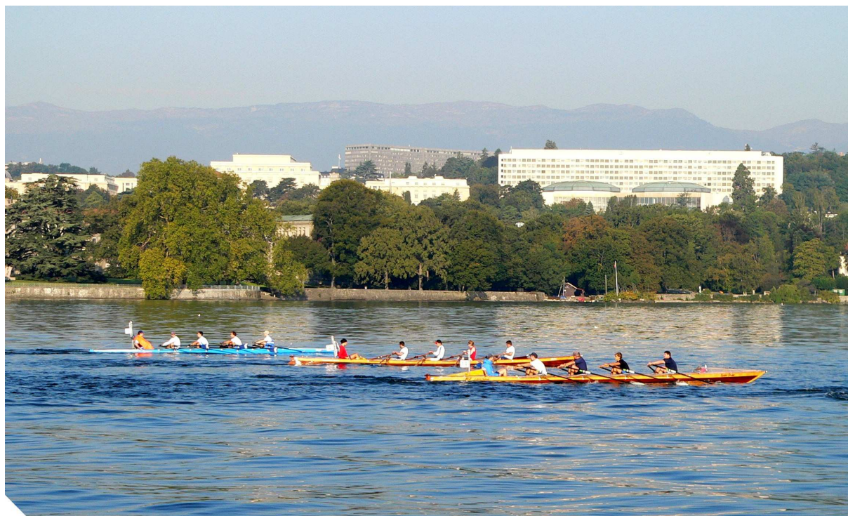
The Crews along the UN premises