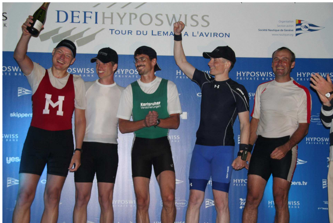
RC HAMM/KARLSRUHER RHEINKLUB ALEMANNIA/ MAINZER RV/STUTTGART-CANNSTATTER